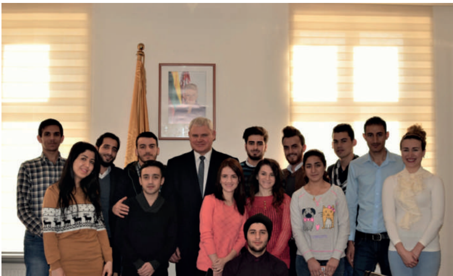
Middle East Scholars meeting with the Klaipeda mayor

The plan for the MES program is to bring a cohort of 12-15 new students from war-affected areas each year.