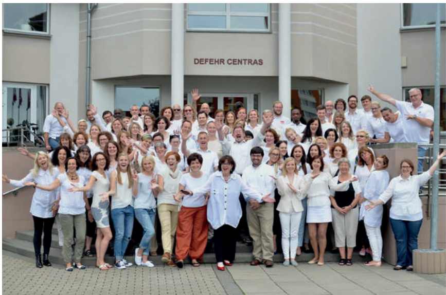
The 2016-2017 faculty and staff

To engage students in a transforming educational experience in order to create a generation of leaders for Lithuania, Eastern Europe, and Central Asia who think critically, promote democratic ideals, develop a market economy, and re-build the network of civil society within the context of a Christian worldview.